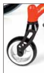
Forks feature inset bearings for smoother turning plus your fork stem caps will never fall off again.